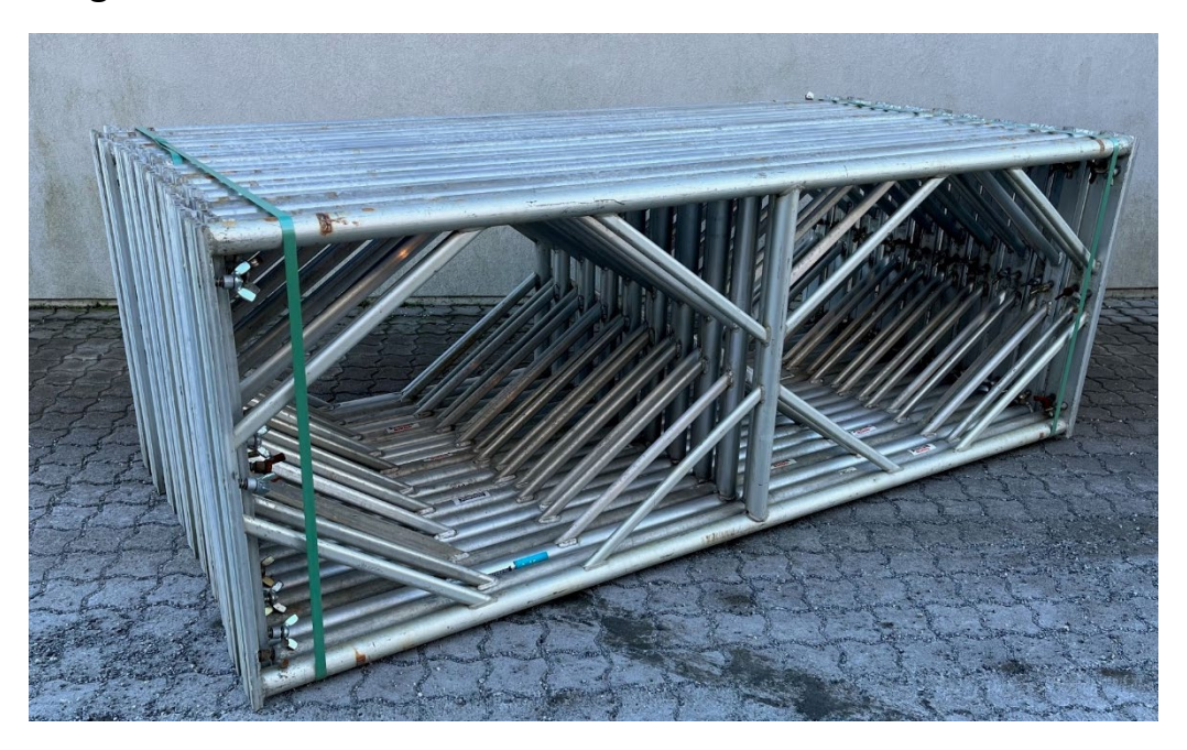
Aluminium beams T225